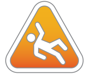
Fall risk patient