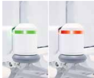
Bed exit side view lights