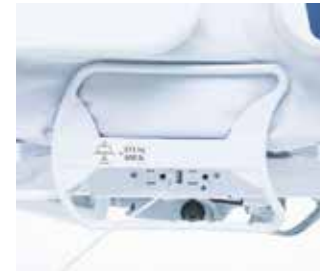
USB power outlets