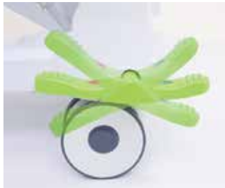
Four casters with central brake

Built-in bed extender increases patient comfort and caregiver efficiency.