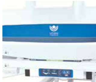
Foot end back-up control on the frame